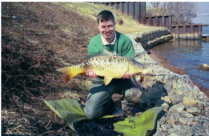
A nice Potomac River mirror

Phil: Not really my scene, although I'll have a go, CAGI, CCC, type are more a draw from the social perspective. To me competitions are always down to the luck of the draw, when large sums of money are required for an entry fee I'm always torn with using the same amount for a pleasure session where I get to pick the swim and hopefully haul, I'm not into hassling folk for sponsorship