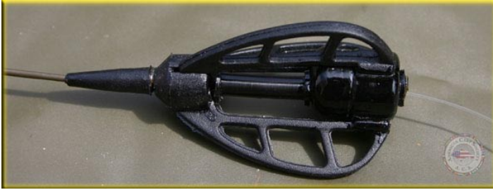
Tubing & Cage on Mainline

mainline as shown pushing the rig tubing into the rubber tail at the top of the method cage, dab with a spot of super glue to secure and then attach the mainline to your hook length via the swivel.