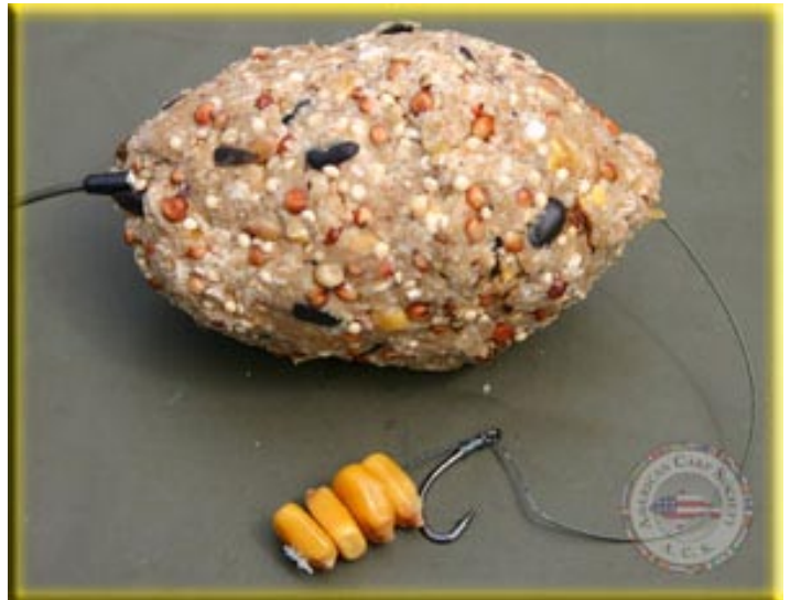
Baited and Ready to go #1