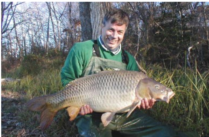
A local river common

Phil: Not any more, trips back are to see family and fishing takes a back seat.. Now my children are getting old enough to fly over here on their own there seems little point in going back to the crowded island.