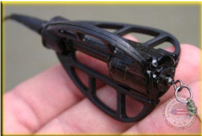
Attach Hooklength #2

Now gently push the swivel home into the soft rubber grommet at the base of the cage. All Fox, Korda and ACS method cages have the soft rubber grommets in their base for this purpose. Tip: Regardless of how you rig up the method cage make sure that it is semi-fixed