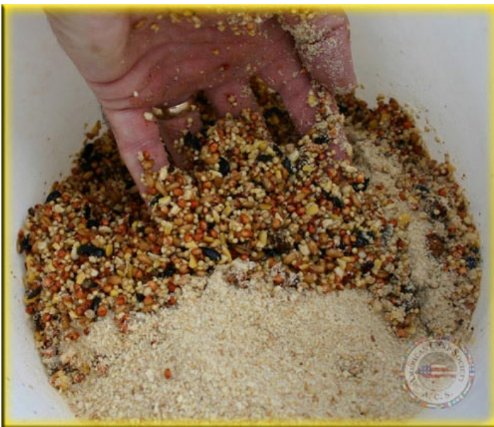
Add the Bread Crumbs and mix

To bind the mix and hold it onto the cage I use bread crumbs, again obtainable from the grocery store or make your own by drying out sliced bread in the sun or in the oven on a low heat and then crunching into crumbs. Place the amount of soaked seed you need into a bowl with a little of the water they were soaking in and then start adding the bread crumb.