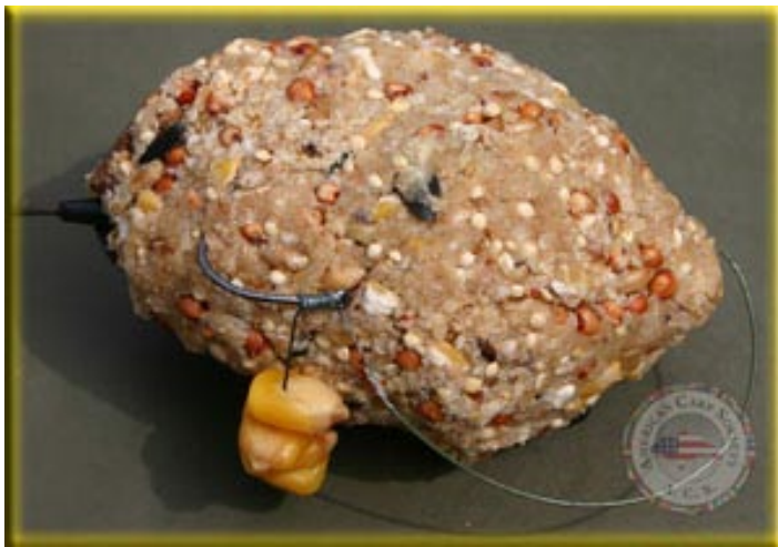
Baited and Ready to go #2

Tip: Load one side of the cage up heavier than the other and pin the hook in the mix on the lighter side, this ensures two things. Firstly that your rig doesn't tangle during the cast and secondly that the hookbait always ends up on top of the cage facing the surface of the water and the fish when it lands on the bottom of the lake. I'll typically catapult or spoon up to 10 balls of the method mix out to my feature to get things started and recast my hook bait with a reloaded method cage every 10/20 minutes for the first hour or until I have the fish in front of me.