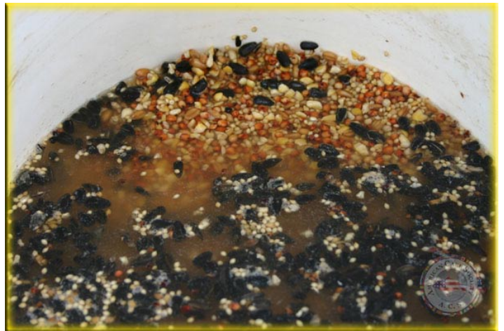
Birdseed Food after a 36 hour soak

I like to add flavor to the water that I soak the seeds in, two of my favorites are molasses and vanilla extract but use whatever you're already comfortable with... Here are some examples of flavor and attractants that are presently in my bait fridge.