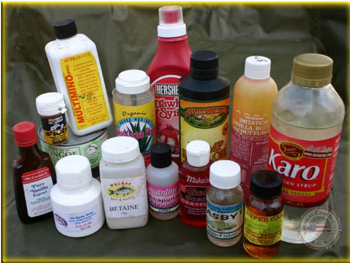
Some of the Flavors & Attractants in the fridge at the moment

To bind the mix and hold it onto the cage I use bread crumbs, again obtainable from the grocery store or make your own by drying out sliced bread in the sun or in the oven on a low heat and then crunching into crumbs. Place the amount of soaked seed you need into a bowl with a little of the water they were soaking in and then start adding the bread crumb.