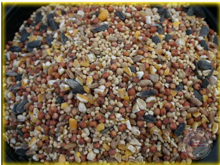
Birdseed Food Dry

Tip: Use two tablespoons of salt per 5 gallon bucket of water, some folks I know use even more but I encourage you to experiment yourself to find a level you're comfortable with. Note: Please don't skimp on the time here because you need the seed to be thoroughly soaked and expanded before presenting it to the fish, otherwise you are feeding the fish with seeds that may seriously harm them!!! When dry seeds of any kind are soaked (re-hydrated) they expand in size by somewhere around 20+% of their original dry size. You don't want any fish with a gut full of semi soaked seeds for obvious reasons. If you also use hemp or any of the larger particles in your mix such as maize, garbanzo or any other kind of beans, please make sure they have also been boiled at a vigorous boil for at least 30 minutes in addition to the 24-36 hour soak. If in any doubt do both the soak and boil to make sure of the fish's safety.