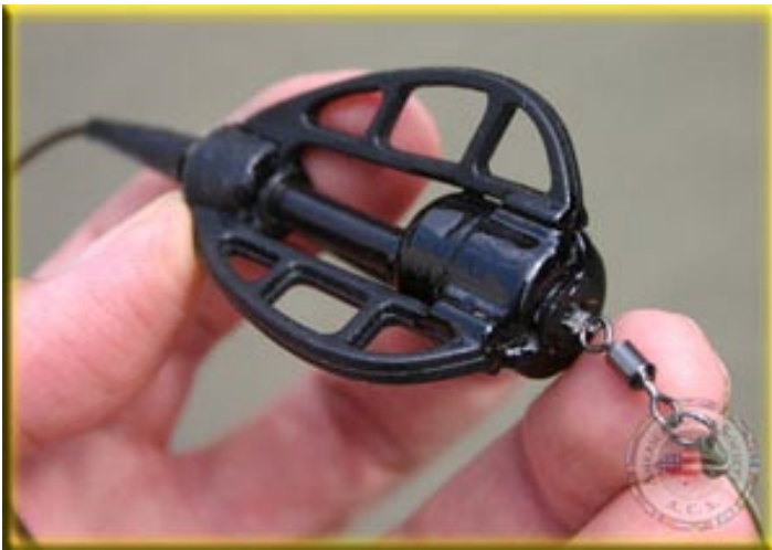
Attach Hooklength #1