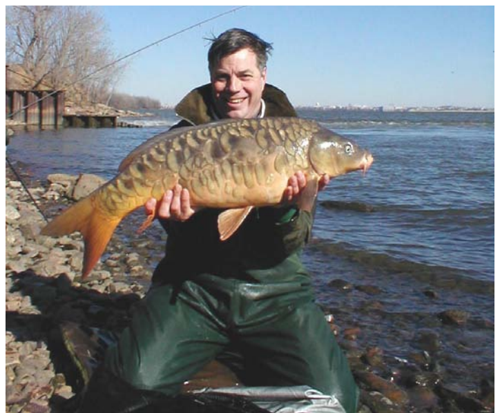
Another nice Potomac River mirror