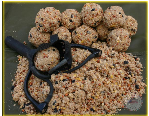
Mix-Balls & Catapult.

After I start getting bites and fish in the net and feel the carp are feeding and "elbowing" each other out of the way to get at my bait I reduce the method mix going in and occasionally spod/spoon/catapult some of the birdseed