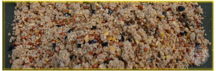
Finished Method Mix