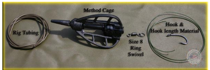
Method Rig Components

Now we've got the mix together lets look at the business end of the rig and how to present your hook bait.