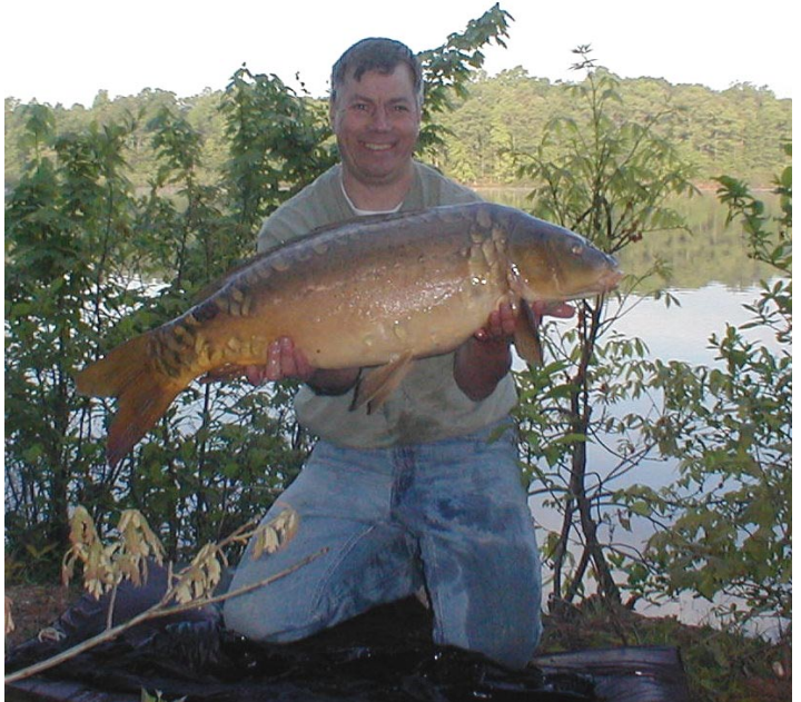
The 'Lake Orange' mirror

Phil: Currently braid, summer fishing on the St Lawrence it's essential to deal with the weed, and being as I'm lazy it will normally last through the winter. Now I'm totally used to braid and it seems strange to fish with mono.